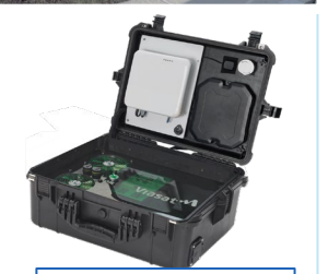
“COMET Pulsar” Fly-away kit