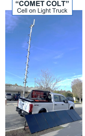
“COMET COLT” Cell on Light Truck