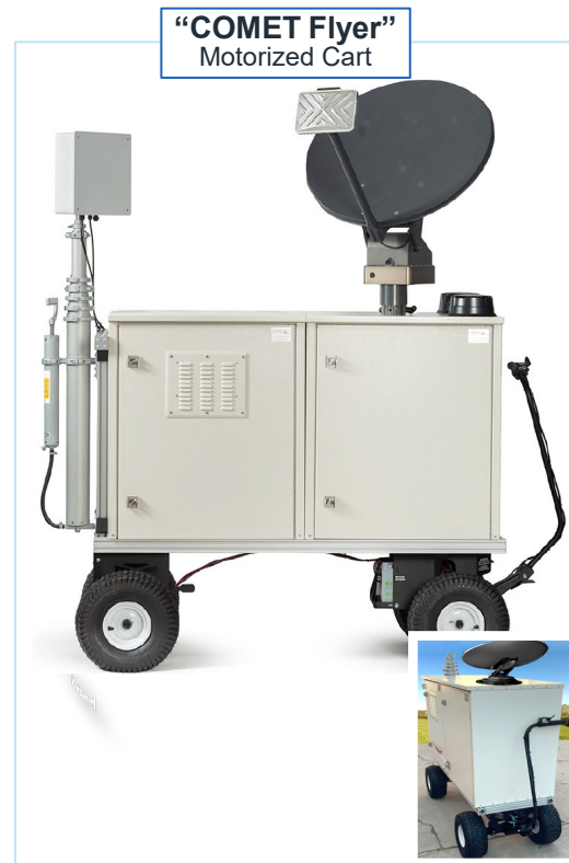
“COMET Flyer” Motorized Cart

Instantly get wide area cellular and Wi-Fi coverage without the long wait for a traditional Cell on Wheels (COW) from a carrier. Our solutions keep you connected with both satellite and cellular backhaul. Best of all, they're compatible with your existing equipment, including cell phones, land mobile radios, and nationwide First Responder networks.